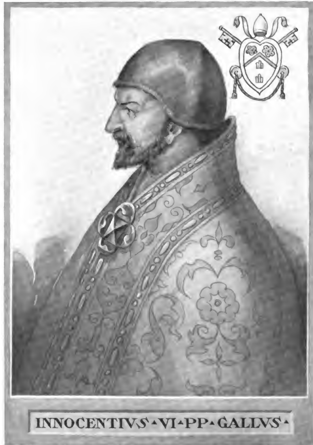
INNOCENTIUS · VI · PP · GALLVS ·